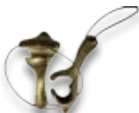
TC642P - Plain steel (sold as a pair)